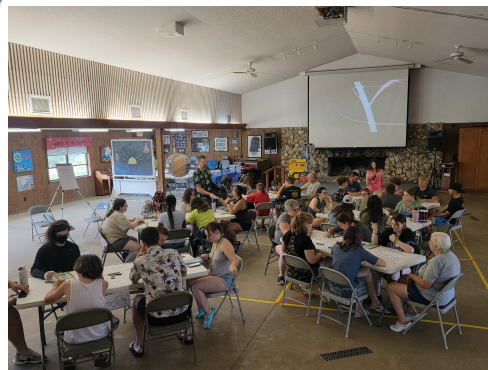
Rocket Class (above) and Pastor’s Class (below) at Sr. High/Jr. High camp!

Thank you to everyone who has contributed to the Campership Fund as this has made a difference in our youth attendance this year. Lives have been impacted in a very positive way and we look forward to the return of many campers next year!